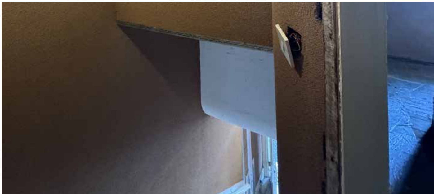
The stairwell at Wardie Square

Wheatley is Scotland's leading housing, care and property-management group and one of the UK's best-accredited organisations. With over 95,868 homes under their management or ownership, they provide their award-winning services to over 210,000 people across Scotland.